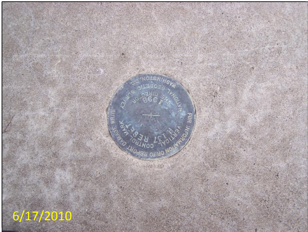
REFERENCE MARK 2